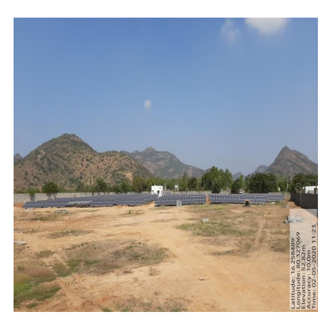
500 killowatts Solar Plant located in 5 acres of land

One 500 kilowatts plant was installed at 5 acres of land located beside Silver Jubilee Block, RVR &JC and another with a capacity of 200 kilowatts at boy's hostel of RVR & JC which are grid interactive and contracted the maximum demand.