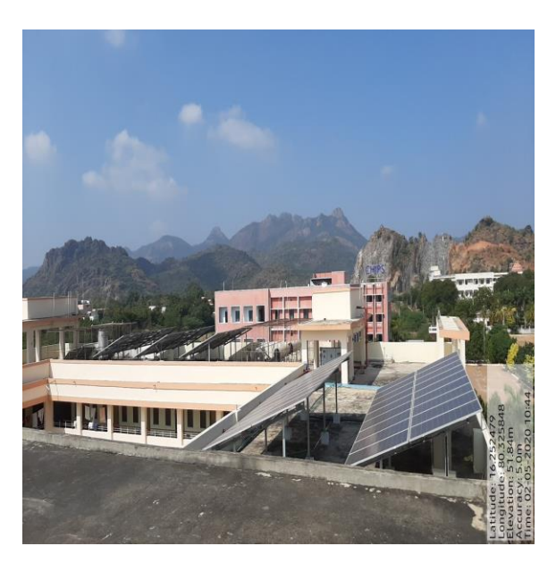
200 killowatts Solar Plant located at College Boys Hostel

Present day need and trend is utilizing green source of energy to reduce carbon footprint with sustainable future. In this regard INDIAN government is also encouraging the same with subsidies. Better late than ever, it's time to protect the nature by utilizing green energy in place of fossil fuels. In this aspect, RVR & JC College of Engineering taking lead to reduce carbon emissions by utilizing 70% of energy from solar.