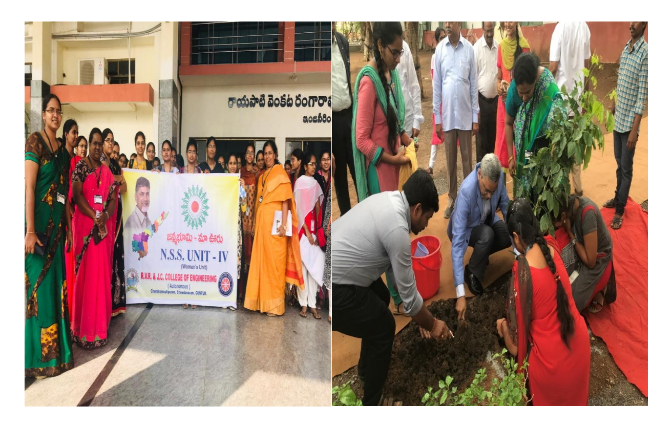
Mega Plantation Camp