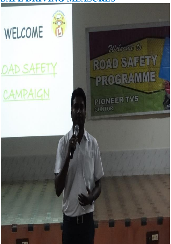
DRIVING LICENSE MELA AND LLR ISSUED