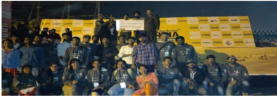
BAJA 2019, E-BAJA, Natrax Indore.