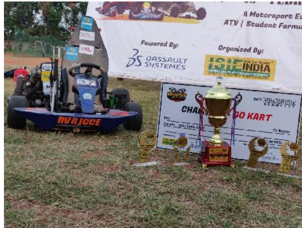
ATV, electrical 2019.