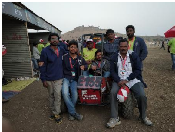
Formula imperial -2019, BIC Noida.Electrical vehicle