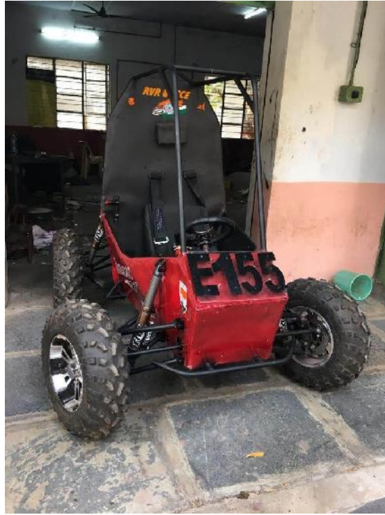
QUAD TORC-2018, Bijnor, UP