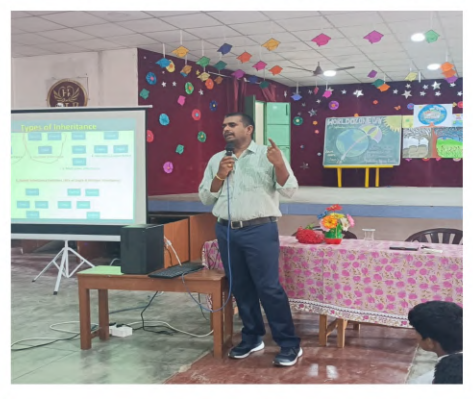
IT Faculty delivered a guest lecturer at KLP