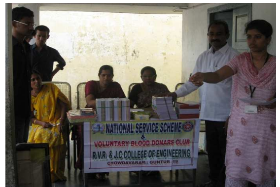
NSS Volunteers during NSS Special Camp with school children