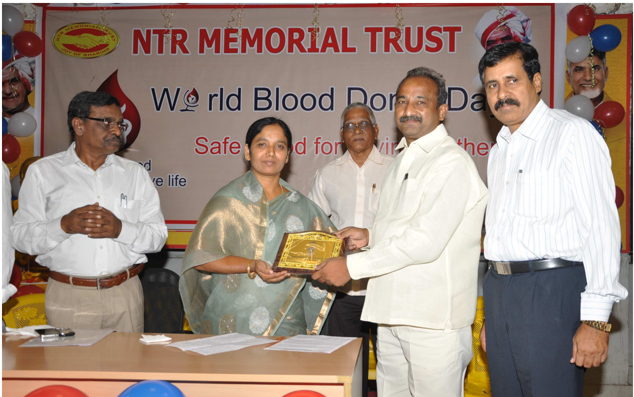
NSS PO receiving State Level NTR Memorial Trust Award from Smt.Paritala Suneetha, Minister-Civil Supplies, A.P., on the occasion of World Blood Donation Day on 14-06-2014 at NTR Memorial Trust Bhavan, Hyderabad.