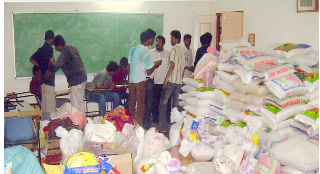
Involvement of NSS Volunteers during Flood Relief Operations