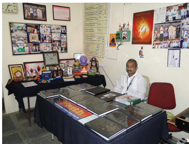
Our NSS Office

Inauguration of NSS Unit and Voluntary Blood Donors Club by Vice-Chancellor of ANU on 15-04-2004.