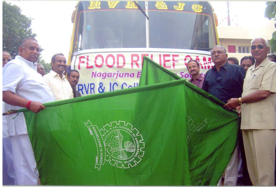
Inauguration of Flood Relief Operations by M.P., Sri Rayapati Sambasiva Rao and our Management Members.