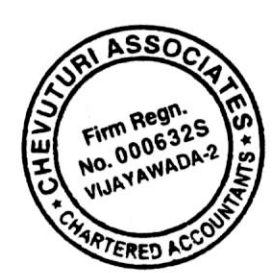
DEAN, FINANCE & ADMINISTRATION